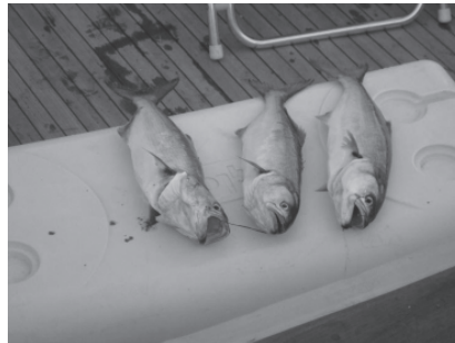
Heading to the smoker!